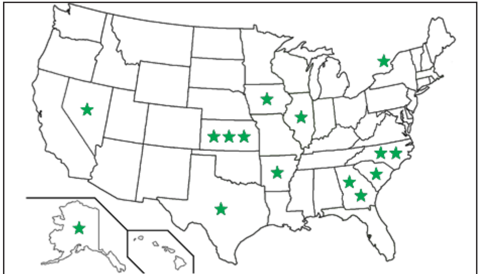
A map showing the location of TEAM's instructors. Find the complete list of TEAM instructors and the workshops they teach at http://www.teamconsulting.cc/instructors.html .