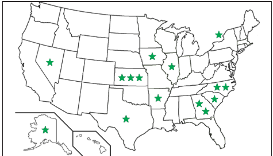
A map showing the location of TEAM's instructors. Find the complete list of TEAM instructors and the workshops they teach at http://www.teamconsulting.cc/instructors.html .