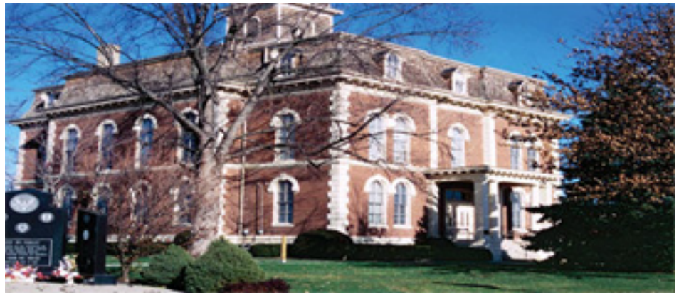
Effingham County Courthouse, Effingham, Illinois

• The county has complete faith that the data being consumed by its users is accurate and reliable. • Because of the efforts to modernize the GIS, the county can now take full advantage of Esri's solution templates. Their parcel tax viewer utilizes the data from the LGIM.