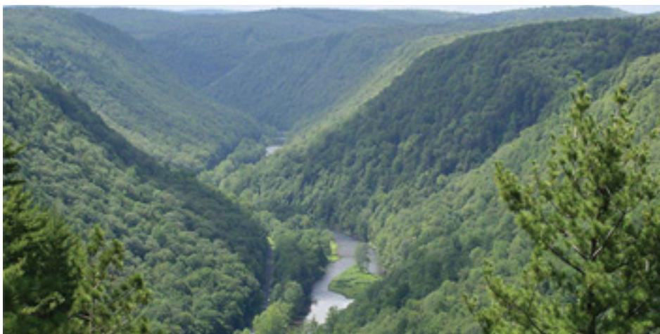
Grand Canyon of Pennsylvania, Wellsboro, Penn.